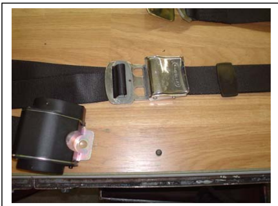
Aston Martin DB5 –using original buckles supplied by