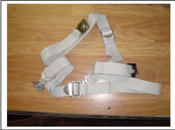
Completely rebuilt Irvin Airchute belts using 'original' hardware and original specification webbing