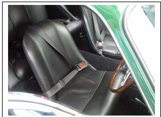
Healey –using original buckles supplied by client