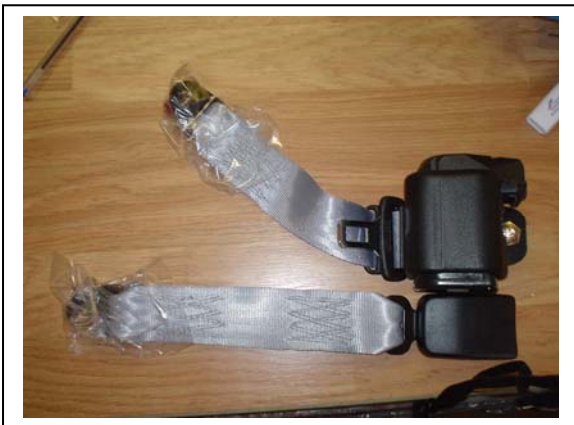
Rolls Royce Belts designed to client's specification