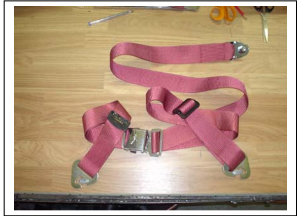
Classic Jaguar Belts using 'original' buckles and original specification webbing