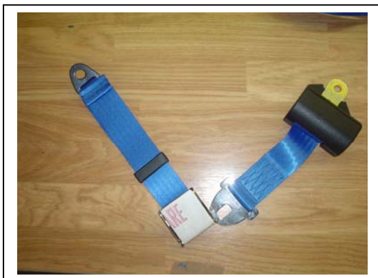
Auto Lap belt designed to client's specification featuring 'neo-classic' buckle