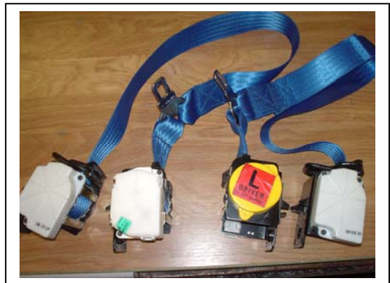
Corvette –Refurbished webbing using original dual reel configurations