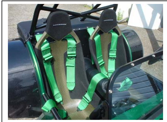
Caterham belts designed to client's specification