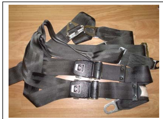
Refurbished Lotus belts – using client's hardware